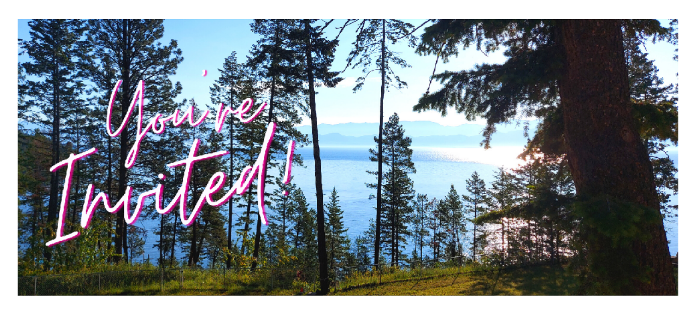
"A shoot shall come out from the stump of Jesse, and a branch shall grow out of his roots." -- Isaiah 11.1