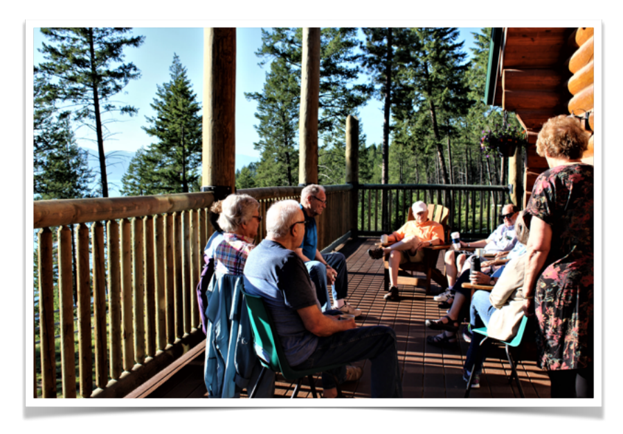
YOU CAN'T BEAT THE FELLOWSHIP OF THE OTHER ATTENDEES!

package of the place, lessons, Christian fellowship, being in God's creation, and sense of peace is part of my happy place.