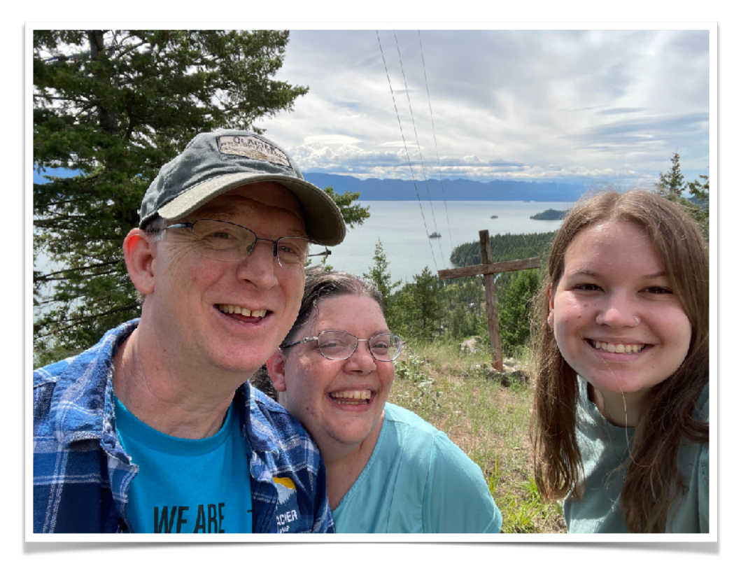
FRIENDS @ THE CROSS

Words cannot adequately express just how amazing this year's Family Camp weekend was; those in attendance were still sharing stories and memories at church this last weekend! Glacier Camp has now