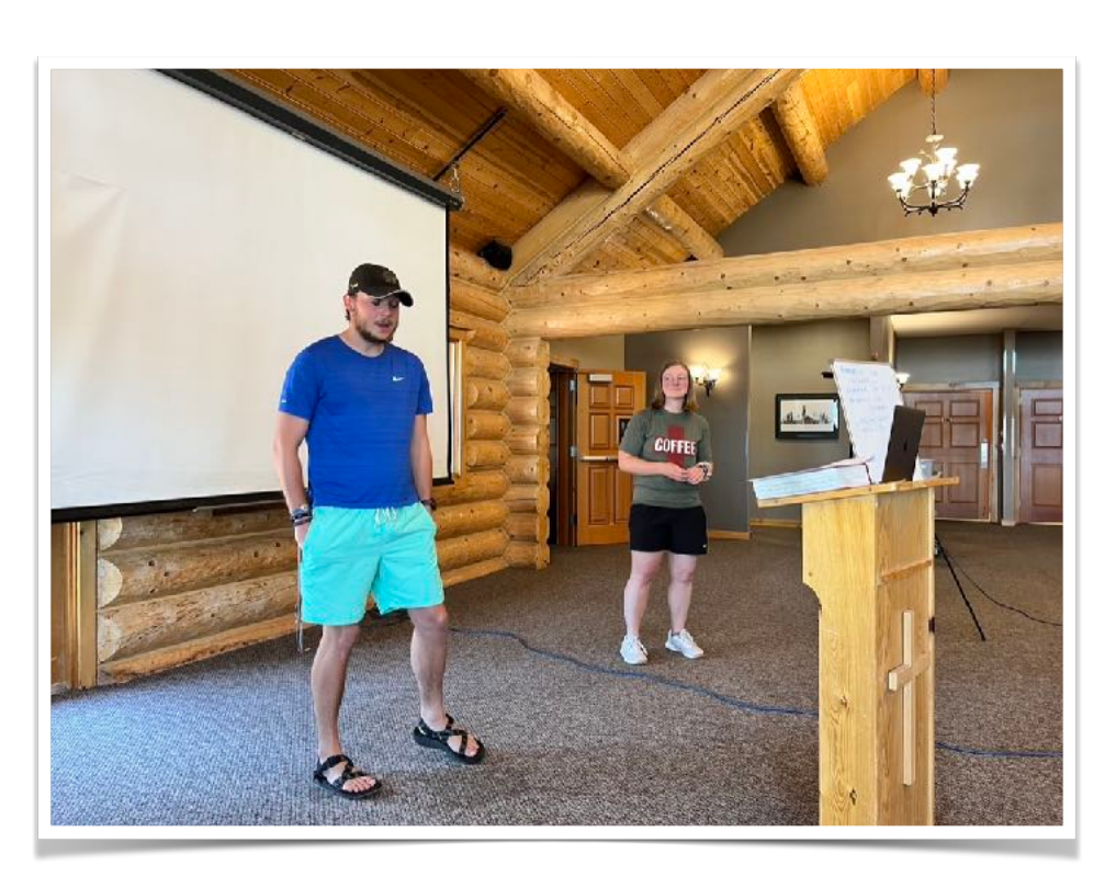
LEAD COUNSELORS SHARE ABOUT CAMP WITH TIM-TALKERS

do enjoy the TIM Talks more than I can express in a few words. The whole